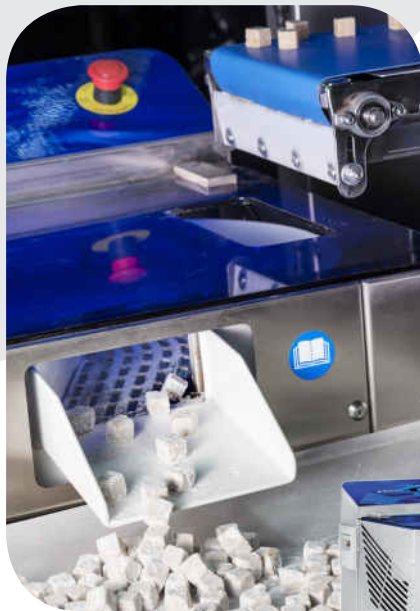
Mould for choccoform Cod. S18

Option to modify to three phase 220 V - 50/60 Hz